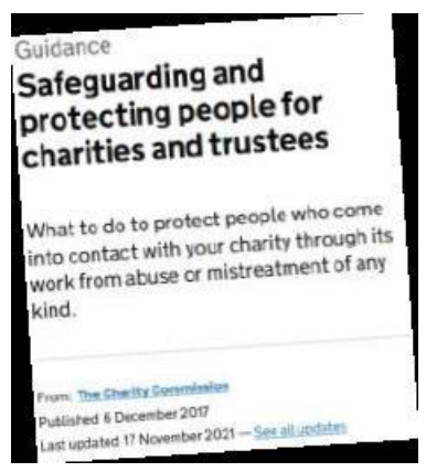
Issued by the key Charity regulator for England & Wales Significantly updated in October 2018, 2019 & 2021 Broadens duties of trustees

At all levels the AFC Wimbledon Foundation adheres to Charity Commission guidance